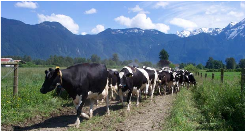
Figure 1. Cows going to pasture at the UBC Dairy Centre