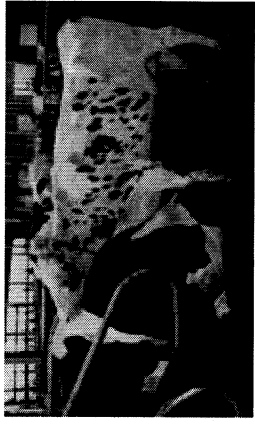
Cows are more likely to displace others from freestalls at high stocking densities